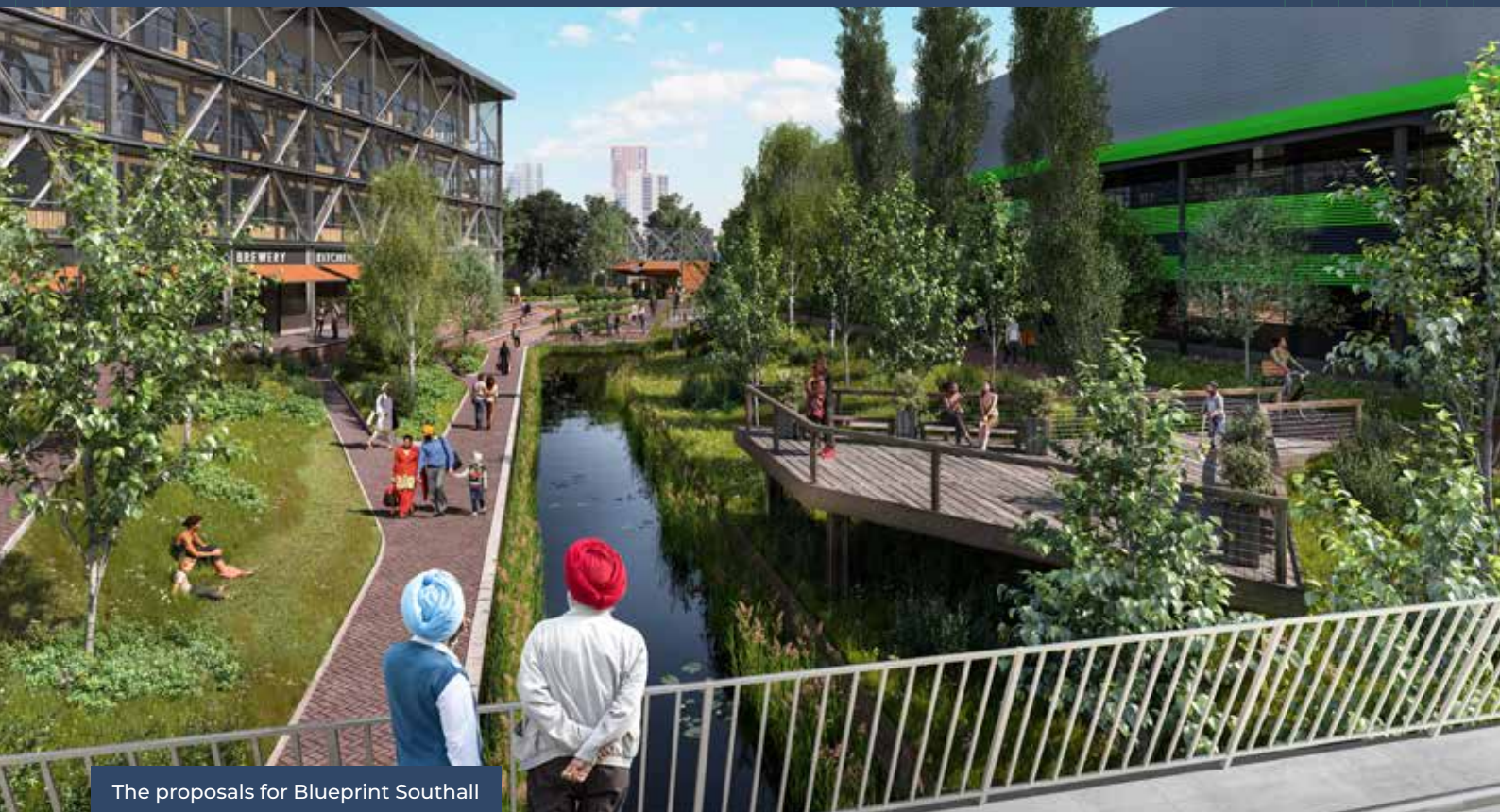
The proposals for Blueprint Southall