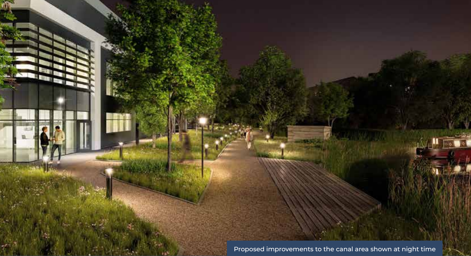
Proposed improvements to the canal area shown at night time