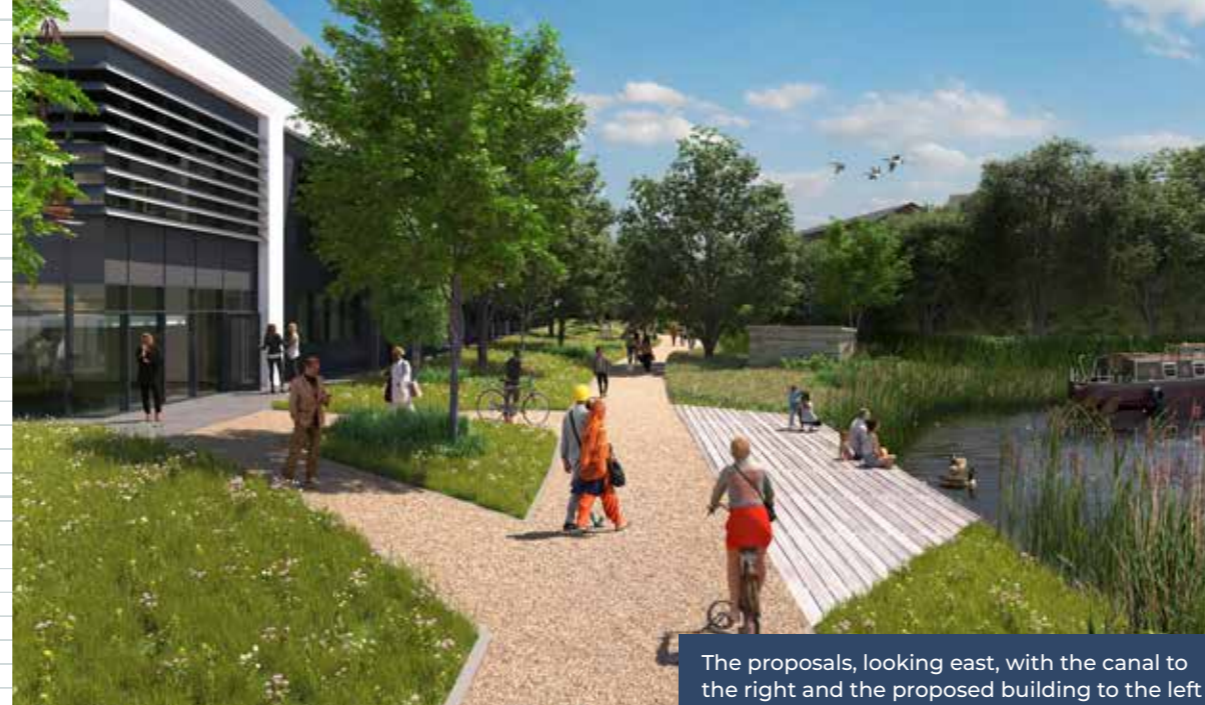
The proposals, looking east, with the canal to the right and the proposed building to the left