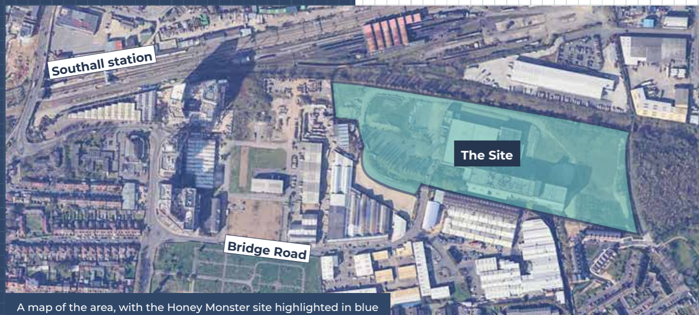
A map of the area, with the Honey Monster site highlighted in blue